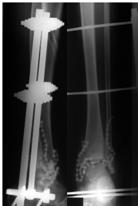
Fig. 1. Resection arthrodesis with AO-external fixator and gentamicin beads applied.

An AO fixator was applied with 4 Steinmann nails. Two Steinmann-nails were inserted with approximately 8 cm distance in the tibia, and two in the calcaneus. We recommend installing the external fixator before resection of joint surfaces and malleoli to prevent malrotation. Therefore draping should leave the knee blank. Predetermined approaches were used if possible. Metalwork implanted during previous operations was completely removed. After radical debridement and sequestrectomy of the infected areas malleoli and joint surfaces were resected. We aim for a neutral position of the arthrodesis with a maximum of 5° valgus und slight dorsalisation of the talus.