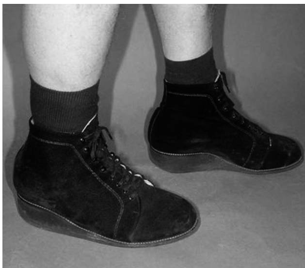
Fig. 2. Orthosis allowing partial weight bearing (left) and arthrodesis boot (right).

lowed incremental weight bearing over a period of approximately 6 weeks. Finally an arthrodesis boot was fitted and used for at least one year (Fig. 2). Follow up examination at mean 4.5 years (23-110 months) included a standardised questionnaire and a clinical examination including the criteria of the AOFAS-Score as described by Kitaoka et al (1994) and radiographs. The follow up examination was performed by an examiner that was not involved in the operative care of the patients.