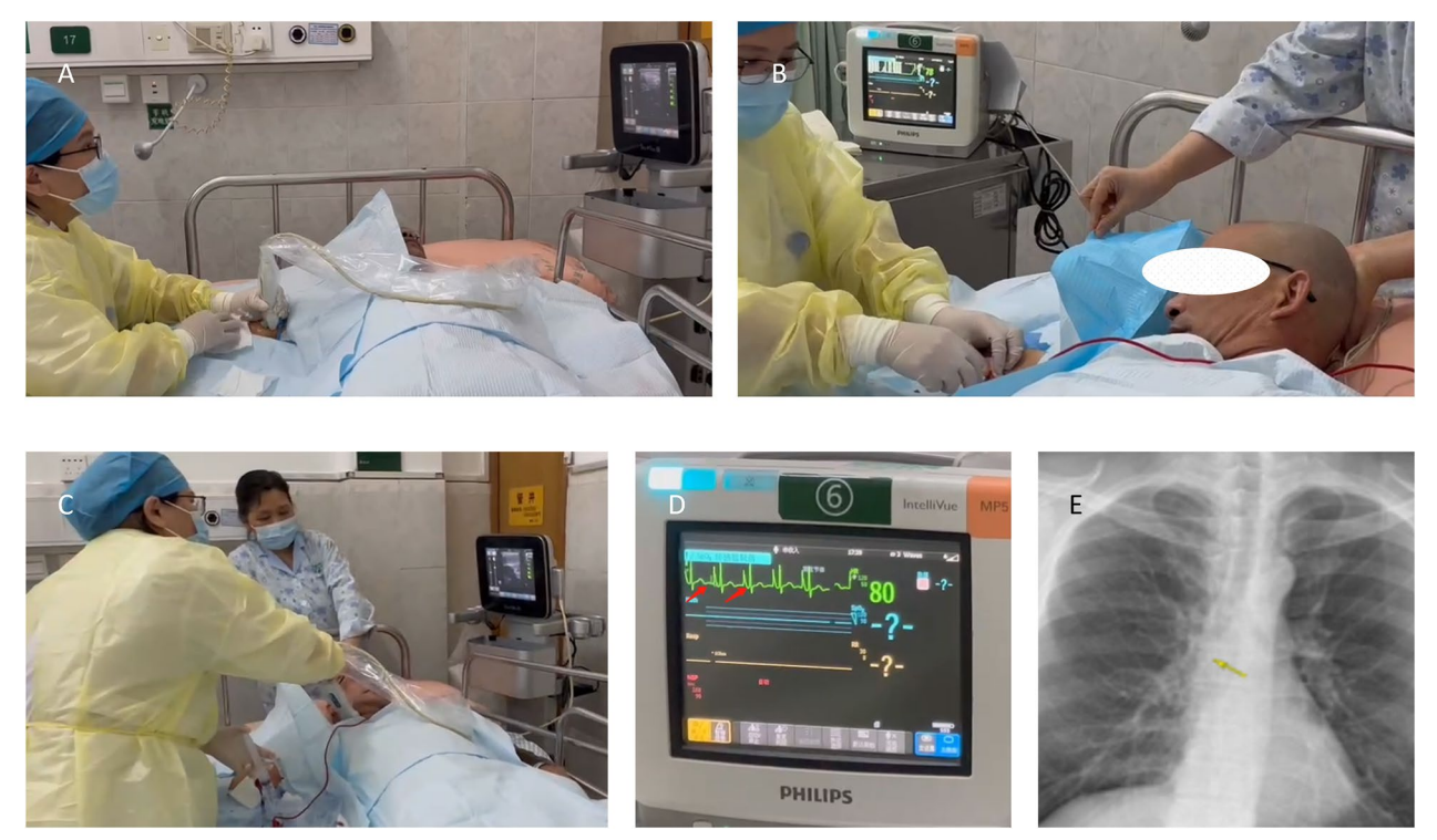
Fig. 3 A Feeding guide wire. B Connecting the electrode wire, and the assistant helping the patient keep his chin close to his chest when the catheter is 15 cm into the catheter sheath. C B-ultrasound examination of the blood vessels in the neck after insertion. D Confirming the catheter insertion length with the specific P wave amplitude on the electrocardiogram. E Infusion therapy after chest X-ray confirmation