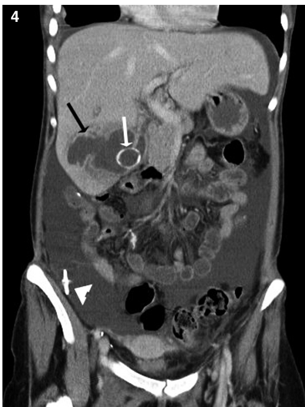
Fig. 1. Large solitary concrement of the gall bladder with a maximal diameter of 27mm, five years before onset of the gall bladder perforation.