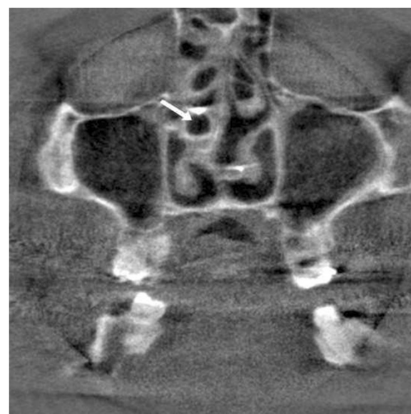
Figure 1 Intraoperative multi-plane reconstruction showing the position of the tube in middle nasal meatus (arrow).

The RAE tube (Mallinckrodt, Glens Falls, NY, USA) was used in 83.3% of cases (n =35), the spiral (xf) in