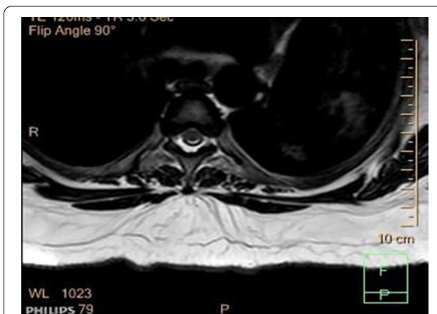
Fig. 2 MRI of the spine. Technique T2W1, T1W1 (post-contrast), transverse view shows: STIR intensity in the intramedullary segment of the thoracic spinal cord and loss of volume of the spine more of the posterolateral aspect

and phosphate were normal. Creatine kinase was normal (20U/L), and her thyroid function tests: TSH: 5.9mIU/L, FT4 12.8 pmol/L.