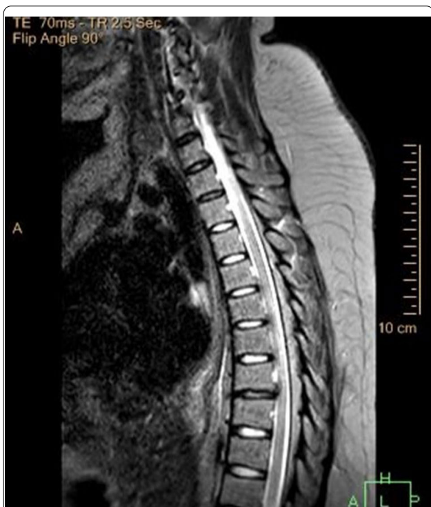
Fig. 1 MRI spine technique: T2W1, T1W1 (pre- and post-contrast) sagittal, axial view thoracic area. The apparent loss of cord volume, more prominent at T5 to T7. Associated bilateral paramedian focal, linear T2W/STIR hyperintensity dorsal cord from the in these regions

We did an extensive serological and CSF workup to exclude both infectious and non-infectious causes of myelopathy. Blood levels for Vitamin B12 and folate were normal (491 pmol/L and 32.7 nmol/L, respectively), her CD4 was 1051 cells/uL with a viral load of <20copies/ml. Full blood count showed leucocytosis of 17 \times 10^9/L with mild anemia (Hb 11.6 g/dl) and reactive thrombocytosis (platelet: 506 \times 10^9/L ) high C reactive protein of 241 mg/L with negative blood cultures. Her U/E revealed hypokalaemia of 2.1 mmol/L and calcium, magnesium,