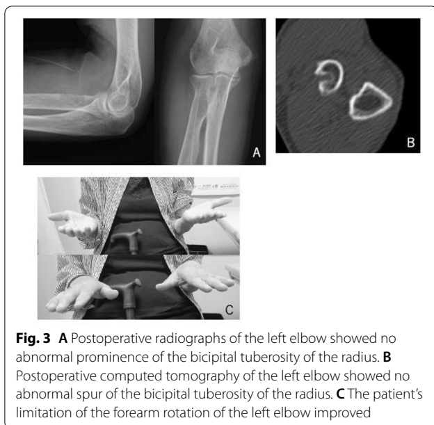
Fig. 3 A Postoperative radiographs of the left elbow showed no abnormal prominence of the bicipital tuberosity of the radius. B Postoperative computed tomography of the left elbow showed no abnormal spur of the bicipital tuberosity of the radius. C The patient's limitation of the forearm rotation of the left elbow improved