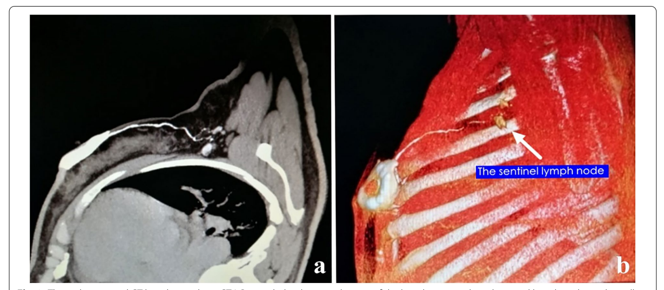
Fig. 2 Three-dimensional CT lymphography. a CT-LG provided a clear visualization of the lymphatic vessels and sentinel lymph nodes in the axillary region. b The sentinel lymph node (white arrow) was located on the reconstructed digital 3D model