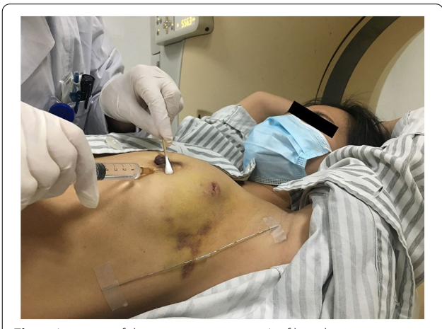
Fig. 1 Injection of the contrast agent. 4 mL of lymphatic contrast agent was intradermally injected into the periareolar region in four (clock-wise) quadrants of the breast before CT lymphography

The CT-LG data of 389 patients were introduced into Smart Vision Works V1.0, software developed by the author, Jianping Ye, for individualized segmentation