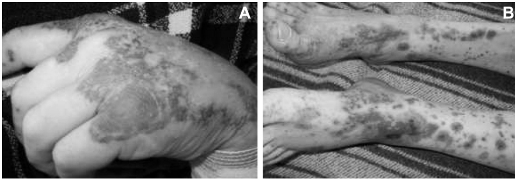
Fig. 1. Skin lesions. Skin nodules, urticarial rash and necrotic bullae (A and B).