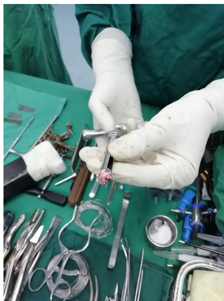
Fig. 2 The talus osteochondral lesion was removed with trephine. White gouty tophus removed with a trephine was found during the operation

and tamped with the cancellous bone on the osteotomy surface of the medial malleolus. Then the medial malleolus was fixed with three cannulated screws after reduction. Aceclofenac dispersible tablets and allopurinol were taken by the patient immediately after the operation and he was advised to use his left ankle passively, with no weight-bearing for 5 weeks. At this time his serum uric acid concentration was in the normal range and a good